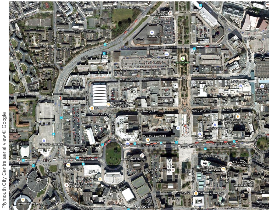
Plymouth City Centre aerial view